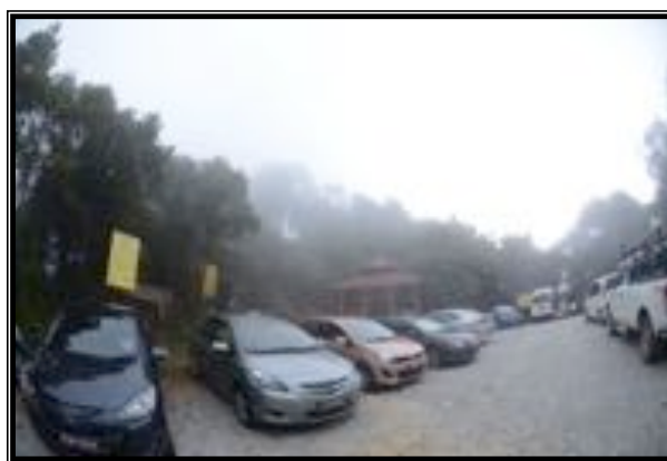
Figure 3.3: Entrance of the Mossy Forest