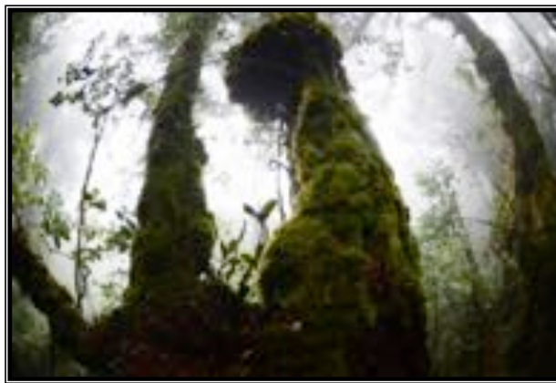
Figure 3.9: Mossy Forest 7