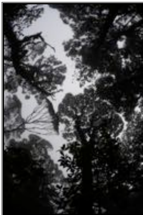
Figure 3.11: Mossy Forest 9