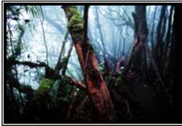
Figure 3.4: Mossy Forest 2