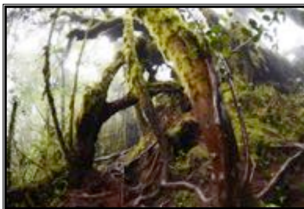
Figure 3.6: Mossy Forest 4