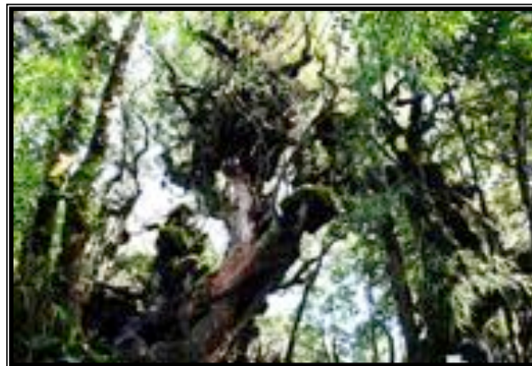
Figure 3.5: Mossy Forest 3