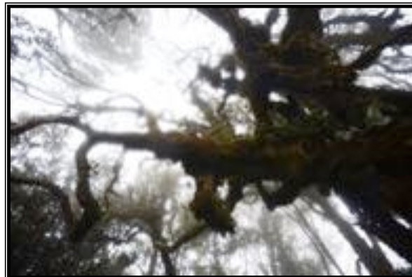
Figure 3.10: Mossy Forest 8