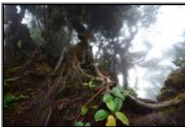
Figure 3.3: Mossy Forest 1