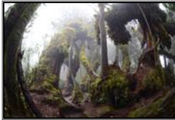
Figure 3.8: Mossy Forest 6