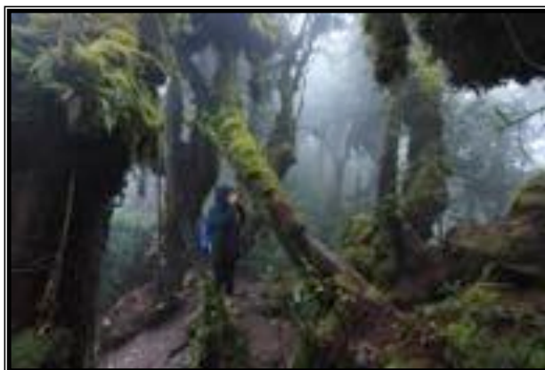
Figure 3.3: Documentation Process by Researcher

Fine arts photography is one of a genre in photography. It allows anyone with a creative mind to express the ideas without being bogged down with the technique. Message is always the first and foremost idea that relate with this type of documentation. Sustaining natural heritage through this medium plays an important role in conveying the message to the audience on how important to maintain the present for future generations. More significantly, the visual informations can create emotional and psychological feelings that may provide awareness through audience's eyes. The skills, techniques and equipments on the image-maker give angle of view more interesting and alive through photographic readings. This is a suggestion of how photography may possibly become significant by the deep unity of its method with those of any art. It would see tools as the untrained human eye could not, it could instruct the human eye and mind and finally it could produce healthy art form. By the use of certain lenses, the proportions appear right quantitatively, and by fine arts feeling for relation for rhythm and for space, it can obtained results which are rare and dignified.