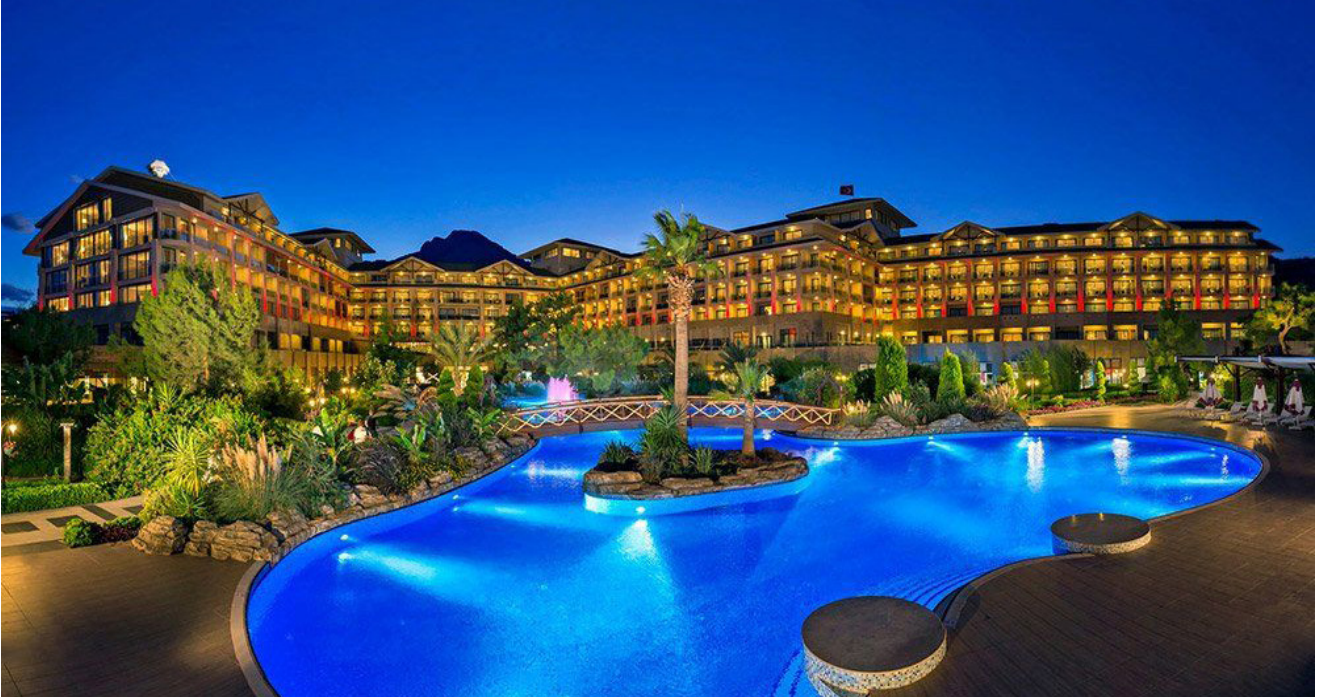
AVANTGARDE RESORT HOTEL, ANTALYA, TURKEY

The Official Conference Hotel for the 16th ICLLCE and IMCoSH Conference Antalya 2019 will be held at the Avantgarde Resort Hotel, Antalya, Turkey , a highly-rated beachfront resort located near the ancient city of Antalya off the beautiful South-West Aegean Coast of Turkey.