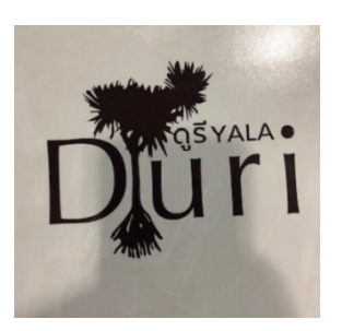
Figure 1 Original logo design before development

The participants of the focus group made interesting comments about the direction of logo development as follows.