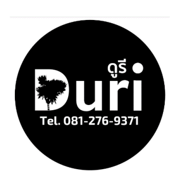
Figure 2 New logo design Model 1