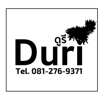
Figure 4 New logo design Model 3