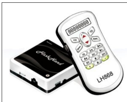
Figure 2. Feedback Receiver of IIRS